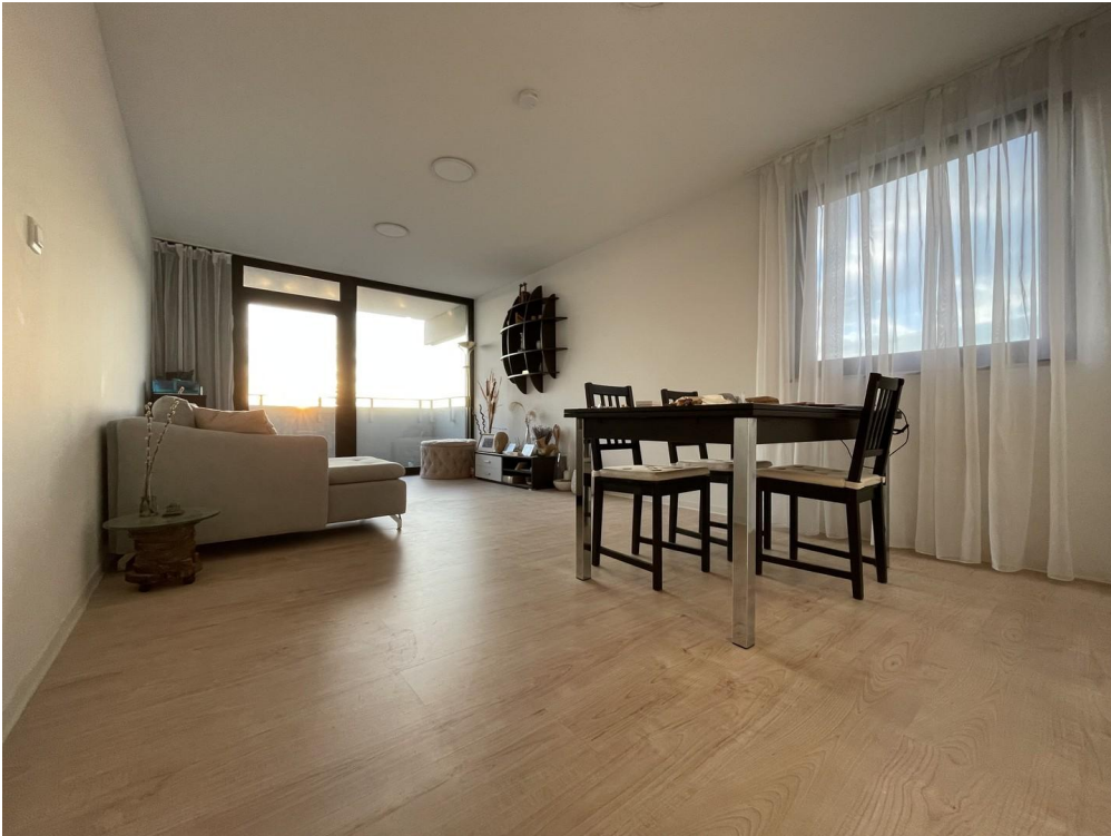
Dining and living room