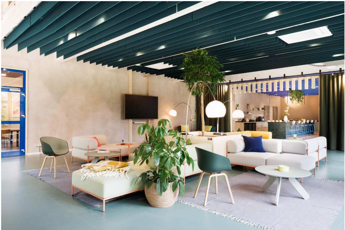
Lounge - Community Space