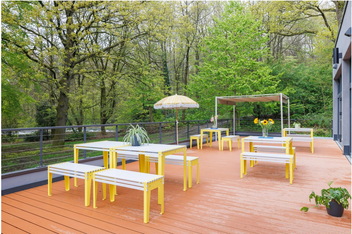
Terrace - Community Space