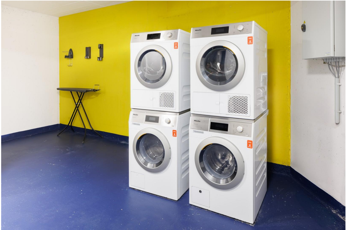
Laundry Room - Community Space