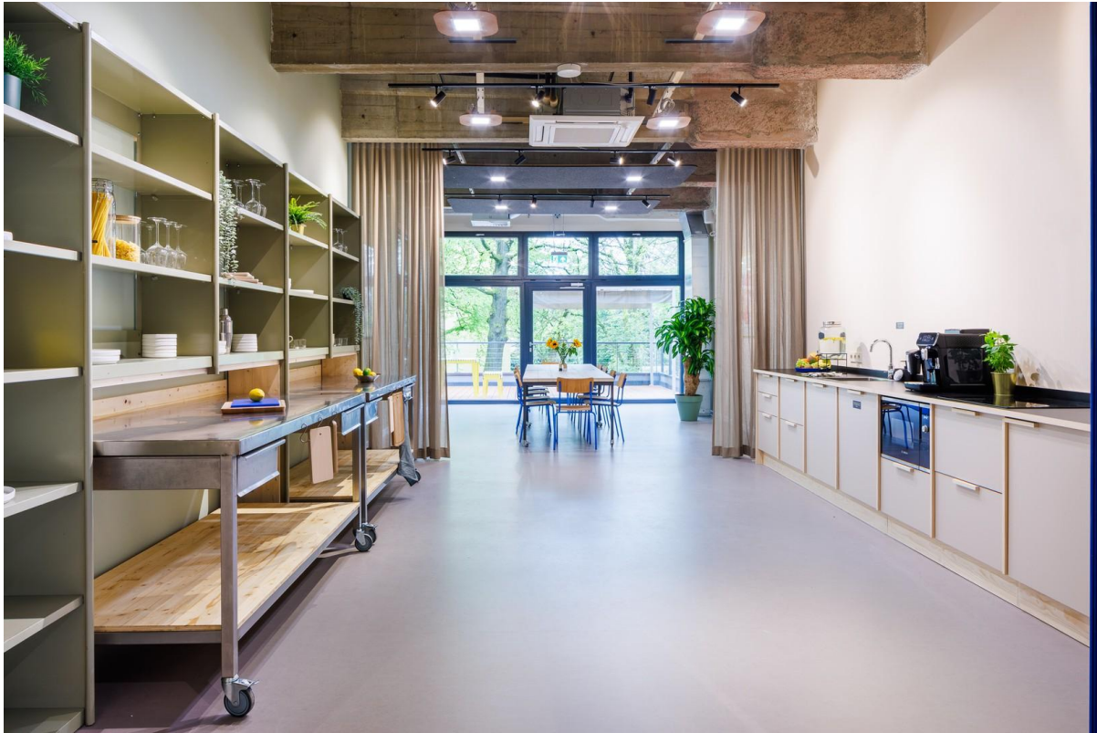
Dining Room - Community Space