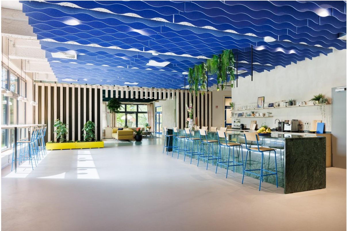
Bar area - Community Space