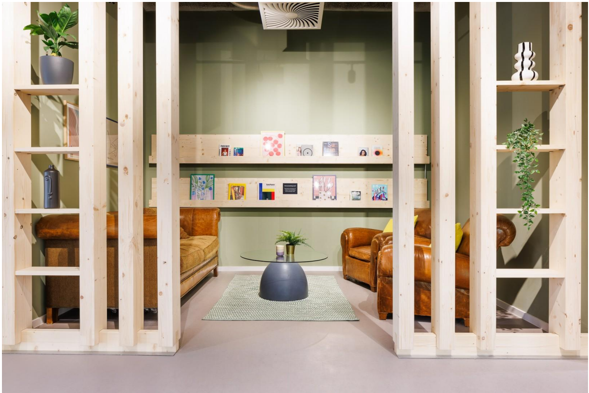
Library - Community Space