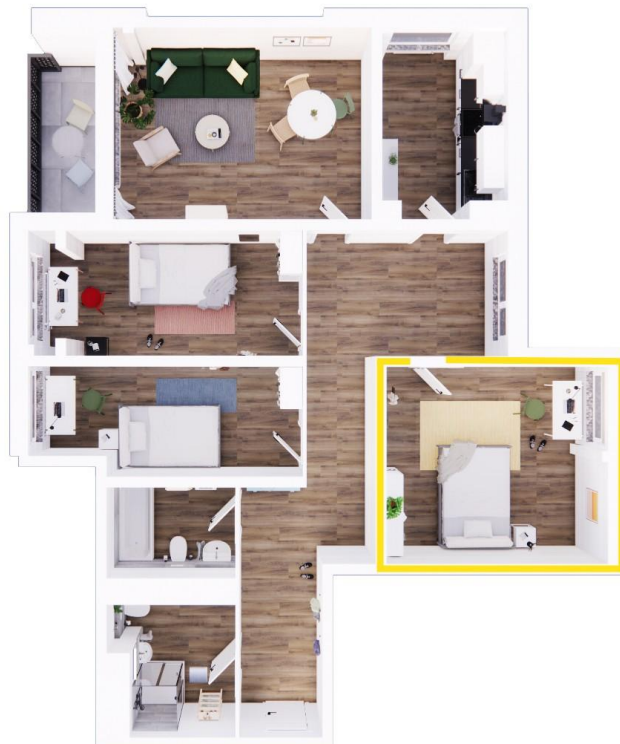
3 -person Apartment