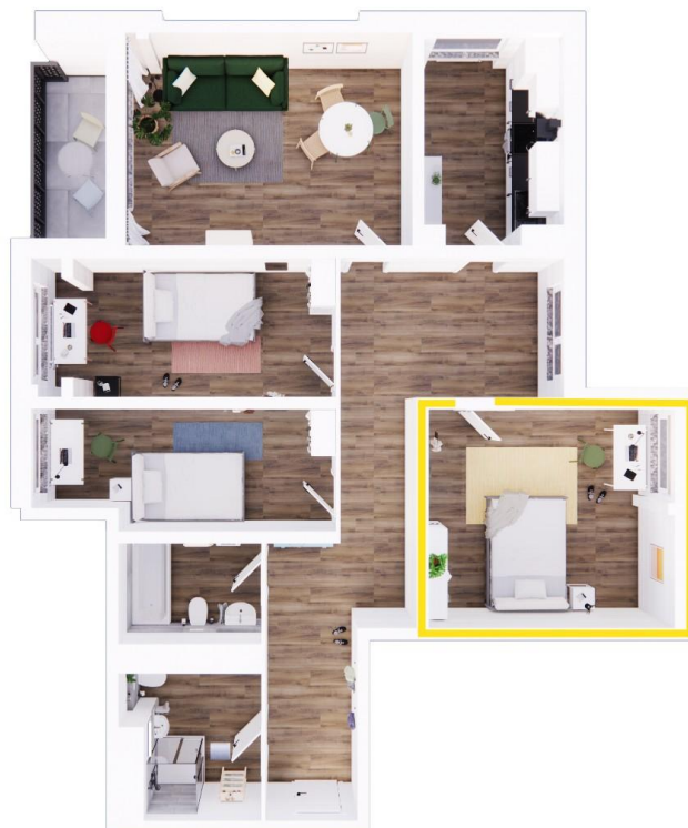
3 -person Apartment