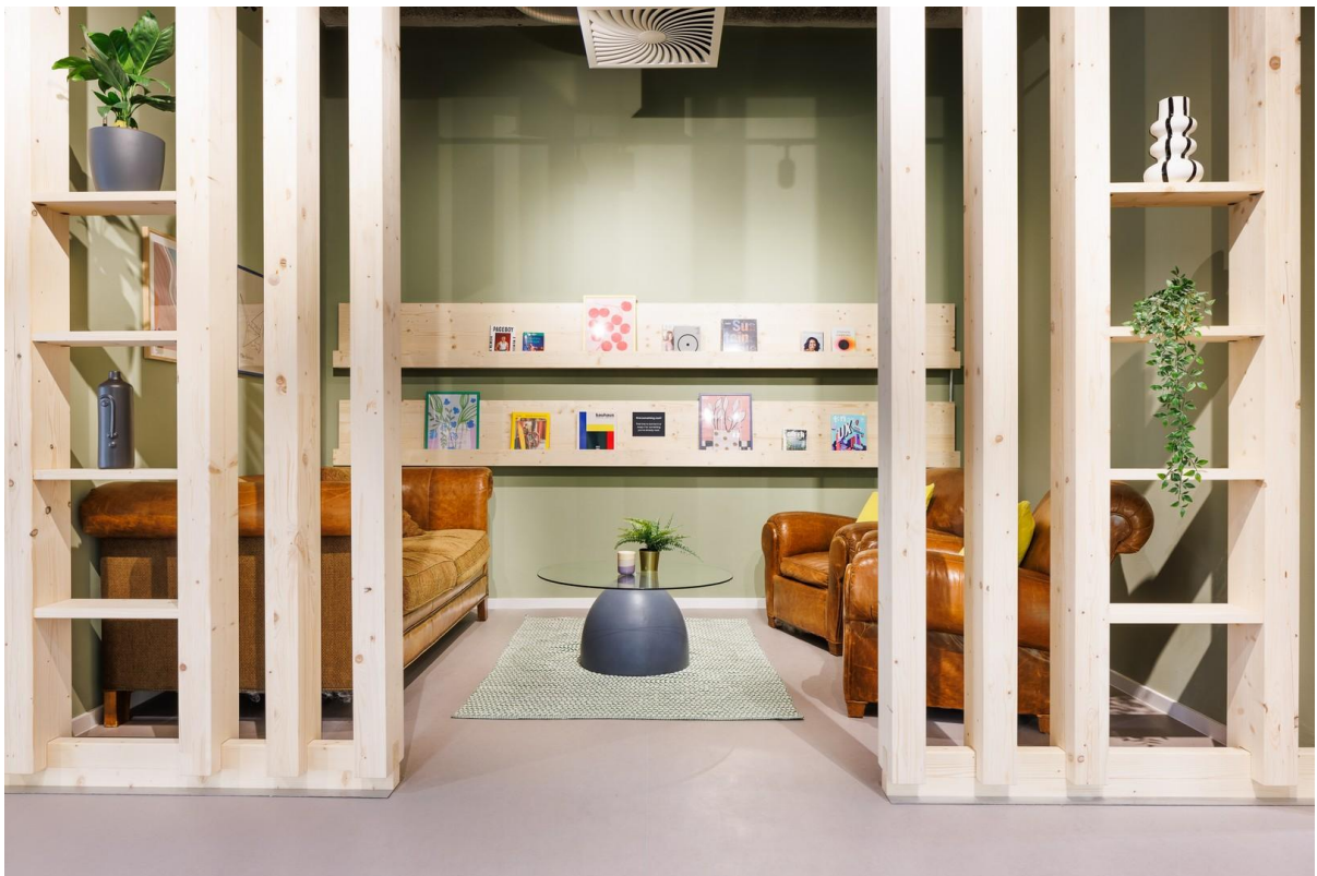
Library - Community Space