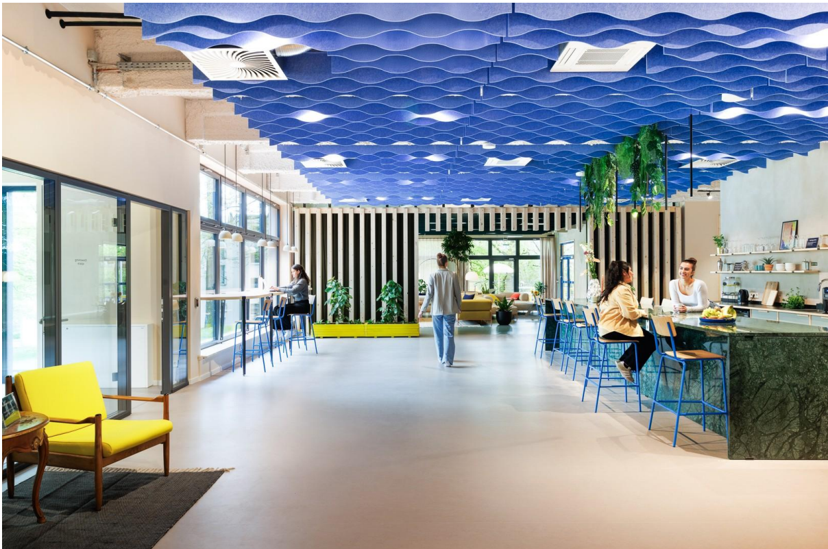
Bar area - Community Space