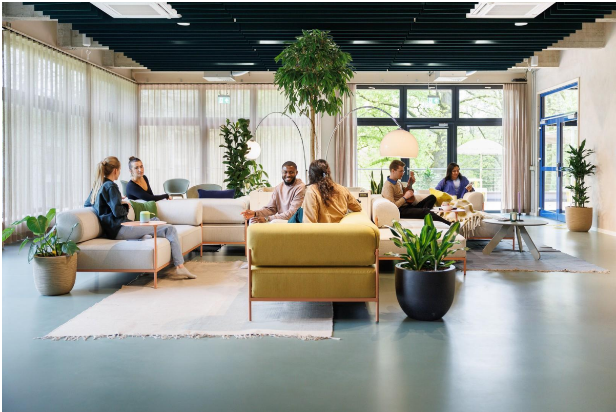
Lounge - Community Space