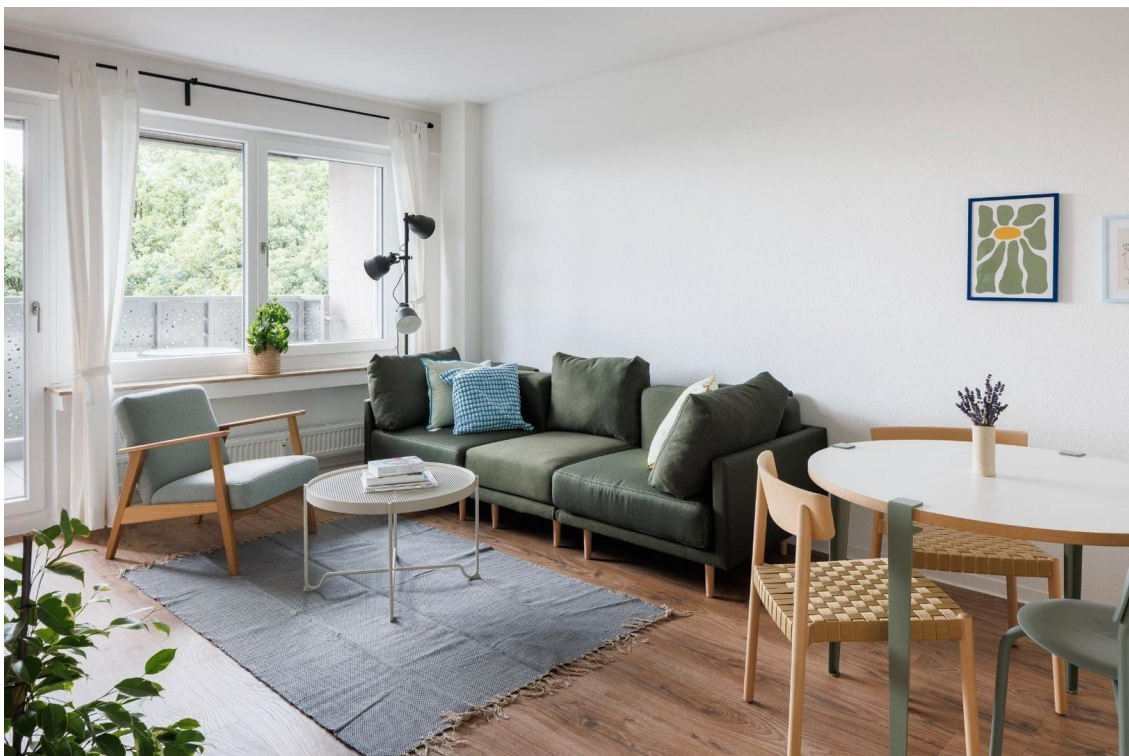
Shared Living Room