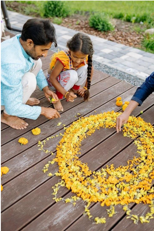
Indian Family 1