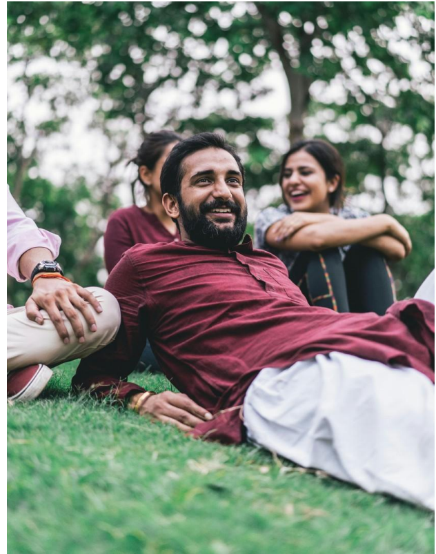
Indian Family 2