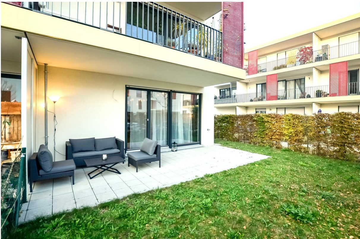
Terrace with garden